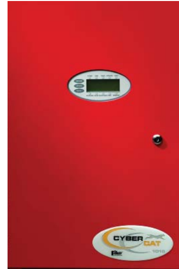
Fike CyberCat 1016

These devices use the SLC signaling line circuits to exchange status information with other devices as well as with the control panel. When an input is activated, it is configured to cause its associated zone to enter into an operational state. Any detection device will cause the associated zone to enter into an alarm state. The output devices are configured to activate to protect and evaluate the endangered zone. This system is completely modular, allowing you the flexibility to design a system that is just right for your application. A typical configuration is shown on page 2 that illustrates the communications of a CyberCat system.