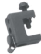
Beam Clamp, Spring Steel