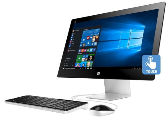
Network Video Server Lite Workstation

Intrusion Detection - can monitor multiple areas of the video image for the presence of moving objects at different times. This can be used to detect and record wanted or unwanted persons.