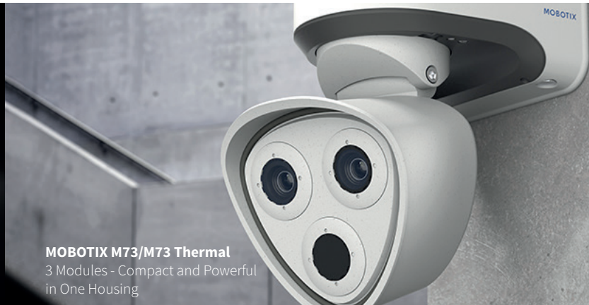
MOBOTIX M73/M73 Thermal 3 Modules - Compact and Powerful in One Housing