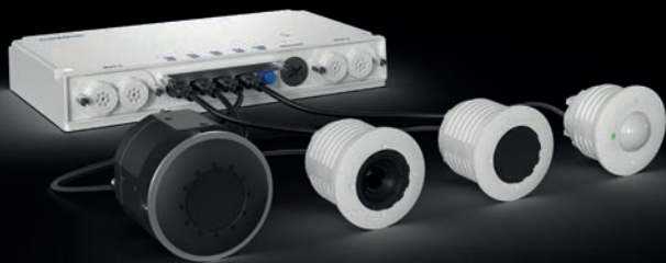
MOBOTIX S74/S74 Thermal Four Flexible Modules Combined in a Single Camera